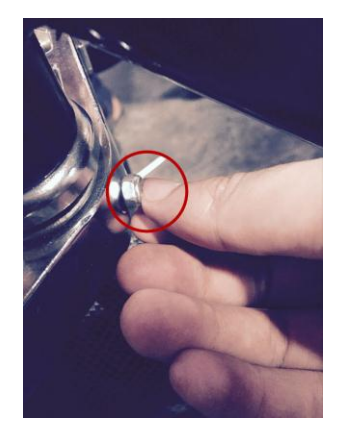
This screw to fixing fenders

Note : this screw same fixed front fork will not fall off, you need to keep 100% tightening