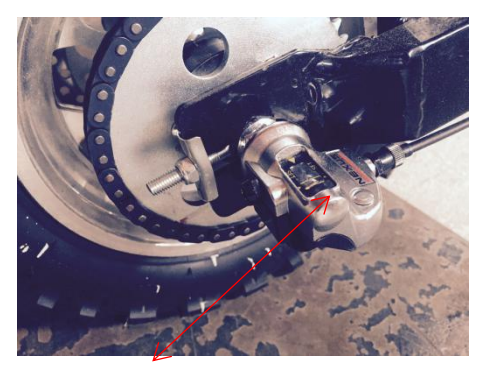
The rear wheel derailleur