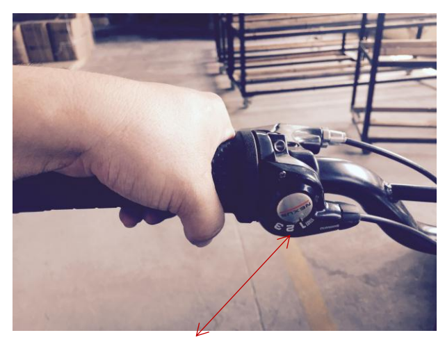
The right hand with 3 speed of change